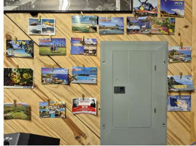
My QSL Wall

Contesting. I have only participated in one or two this year. I make very little points. My objective is to make contacts in countries where I have not made contacts before. And of course, exchange QSL cards when possible. You can find a contest calendar here: https://www.contestcalendar.com/index.php .