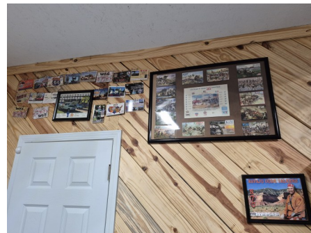
My special event wall

You can find that here: https://www.arrl.org/special-event-stations . Route 66 on the air is a multi-station event where you can get a certificate by making a "clean sweep." That event commences in September.