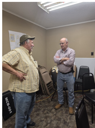
Jimmy Hart visit