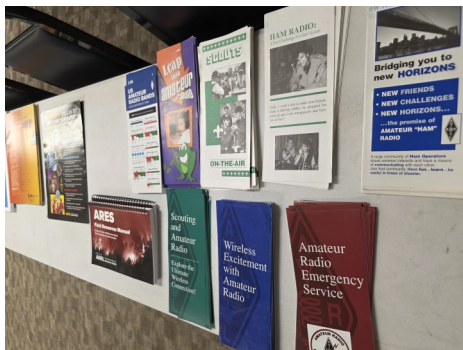
Information Table @ Field Day

Please comment or make suggestions concerning our newsletters. kf5sed@gmail.com